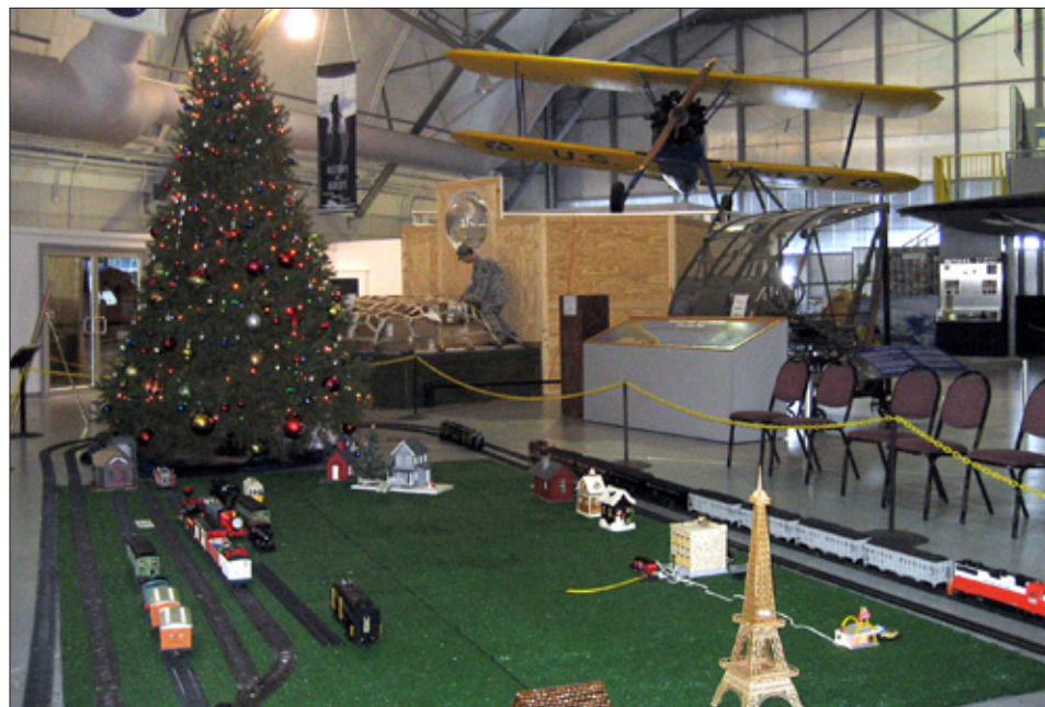
Trains will run for the second year at the Air Mobility Command Museum in Delaware. In addition to the three layouts on display, visitors can enjoy vintage military aircraft and aircraft displays!