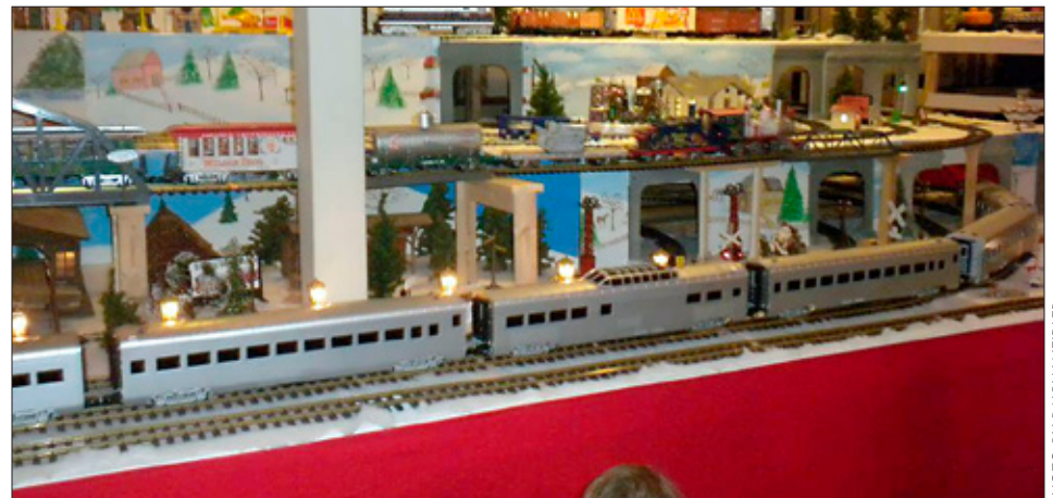
The Toys for Tots Railroad on Long Island, New York collects toy donations for needy children during the holidays.